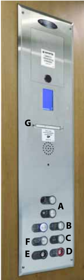
Figure 1 Keyed COP