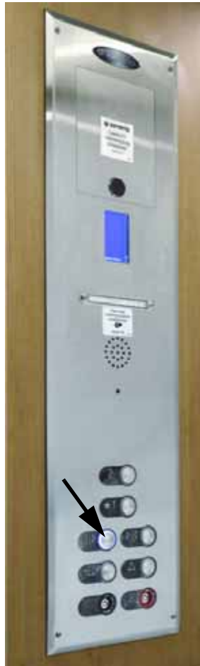
Figure 3 Door Open Button

When the elevator is at a landing level, the doors can be opened by pressing the Door Open button. Normally the doors will have opened and already closed automatically. The Door Open button allows the door to be reopened.